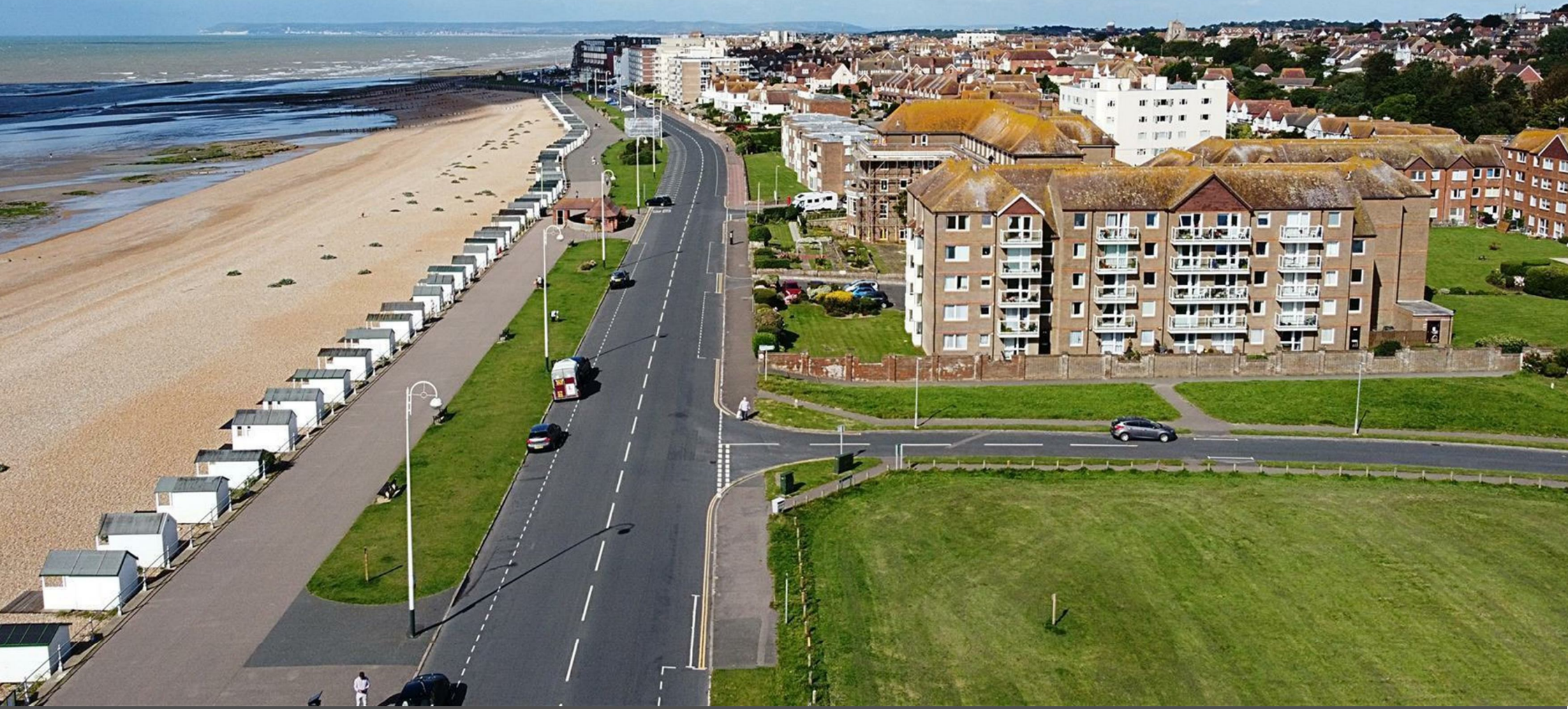
7 Homewarr House De La Warr Parade, Bexhill-On-Sea, East Sussex TN40 1PL Guide Price £112,000